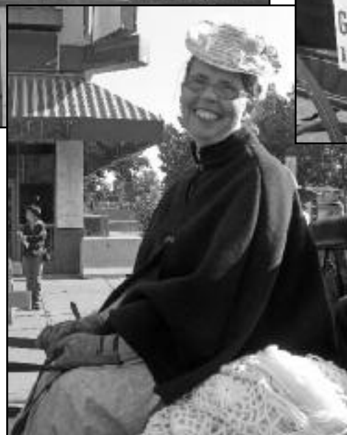
Scenes from the 2009 Stampede Parade