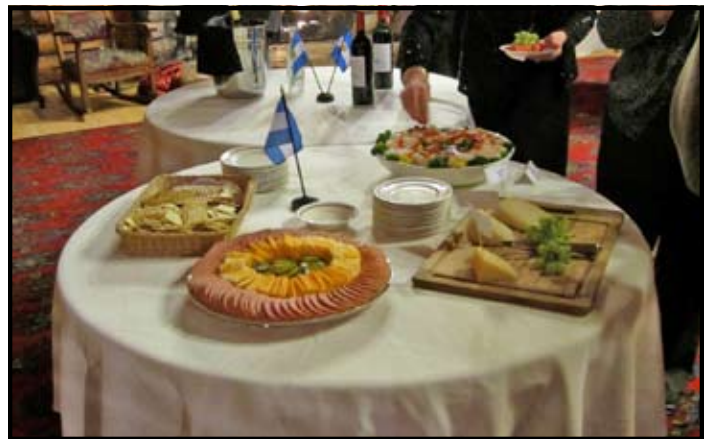
Excellent wine and gourmet appetizers.