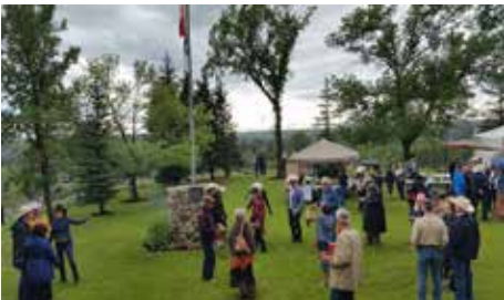
The crowd gathers..