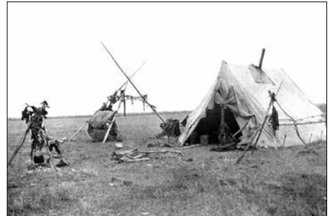
Drying meat, Siksika reserve, 1900