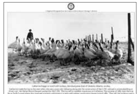
Hogge Ranch, Davisville, 1895

These and other images from the Stampede Display are being circulated through our Facebook and Twitter feeds.