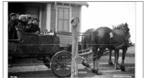
Bennett buggy, ca 1930