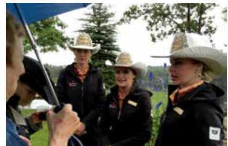
Stampede Queen & Princesses