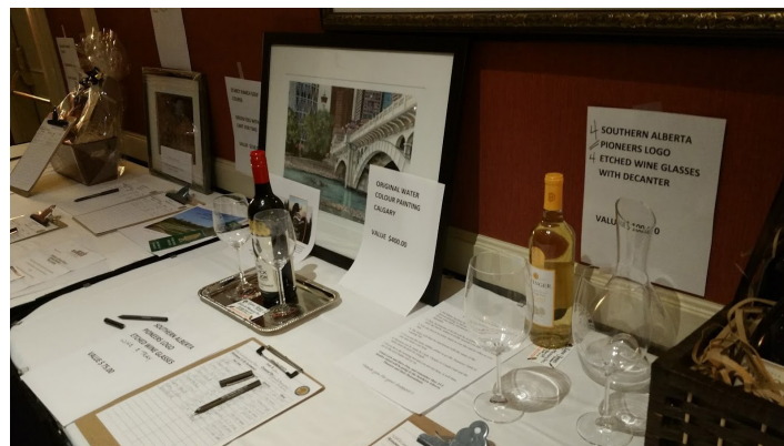
Donations for our successful auction