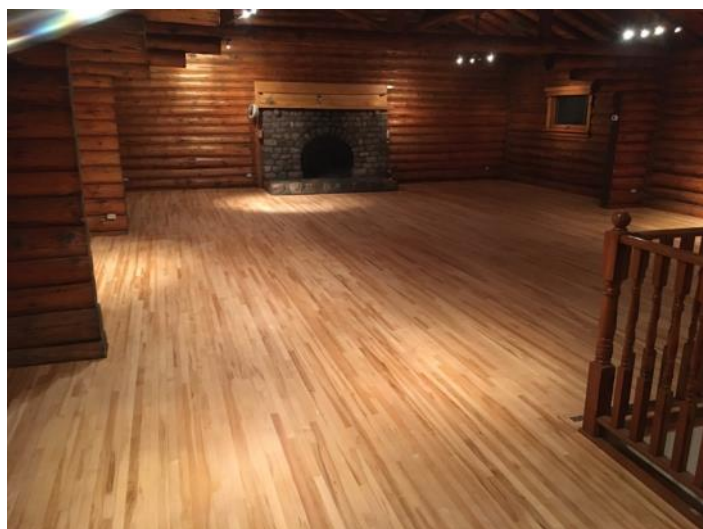
The hardwood floor was refinished with a urethane coating; it looks as good as new.

We have enough money in our Memorial Building fund for the projected gap of $88,700; however, we don't want to deplete this fund, so we need to keep up our fundraising initiatives.